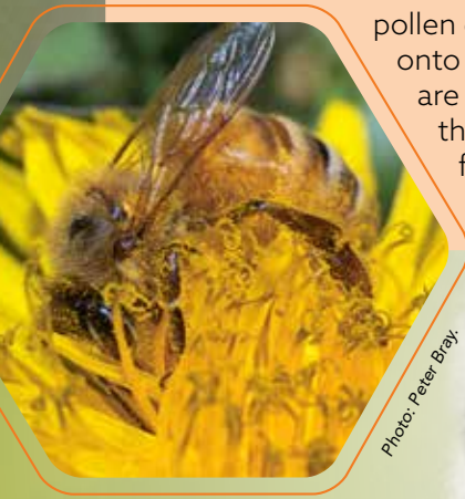
▲ A bee covered in dandelion pollen.

Bees are attracted to flowers because of their nectar and pollen. Bees will collect pollen directly or pollen may fall onto their bodies when they are collecting nectar. When the bee wriggles around to find the nectar its body rubs against the pollen .